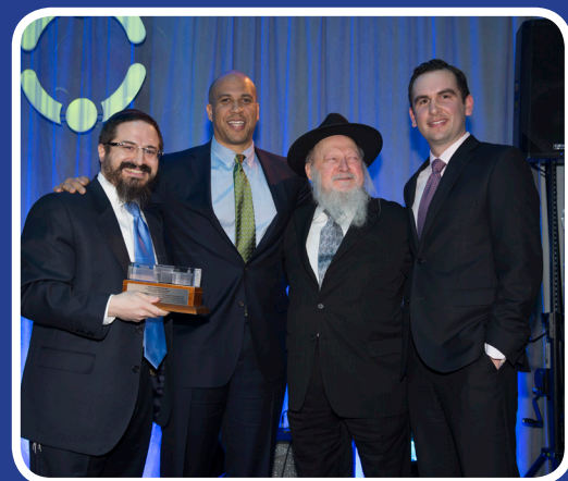
Senator Cory Booker